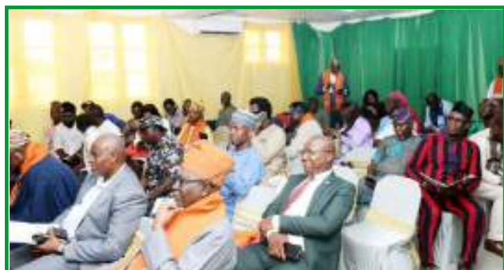
Caption of participants during the Public Lecture Lecture 3rd NIFEngM Fellowship Conferment Ceremony at NSE Secretariat, Ikeja Branch